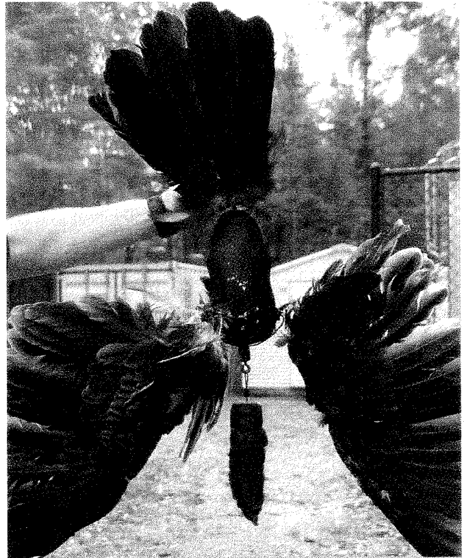
Integrated techniques for resolving conflicts with vultures may include using real or constructed effigies/models.

Wildlife Services' National Wildlife Research Center (NWRC) conducts research on a wide variety of wildlife damage issues. Scientists at the NWRC's Florida field station carry out studies to better understand vulture populations and their ecology and behavior in order to develop strategies that help minimize property damage, protect agriculture, and relieve health and safety concerns caused by vultures.