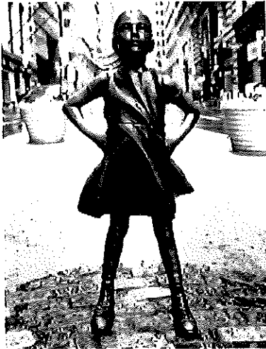
Fearless Girl - Artist: Kristen Visbal - Bronze Statue (2017)